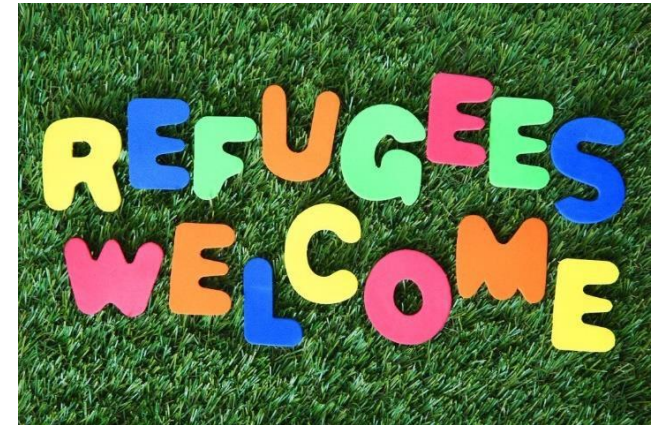
'Refugees welcome' by Tim Reckmann https://ccnull.de/foto/refugees-welcome/1003589

This leaflet is produced by [details of your group/church]