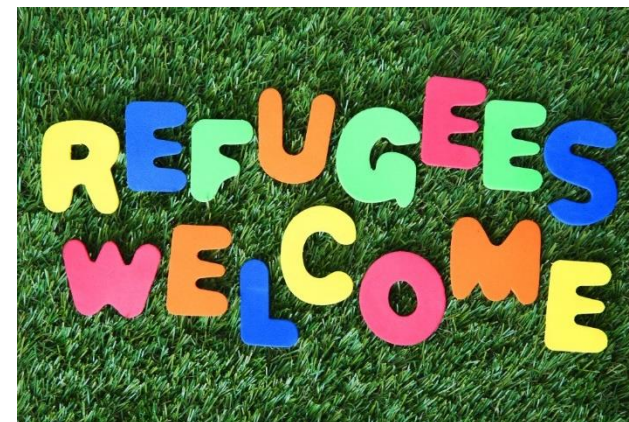
'Refugees welcome'