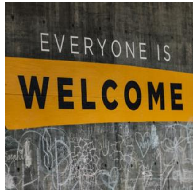
'Everyone is welcome'